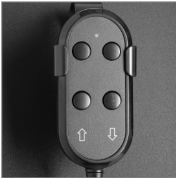
incl. wired touch control