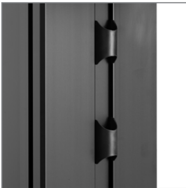
incl. cable management