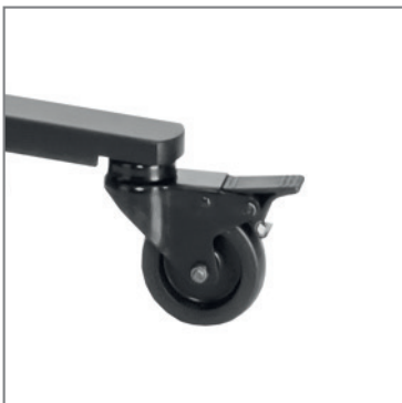
incl. castors with lock-type brake